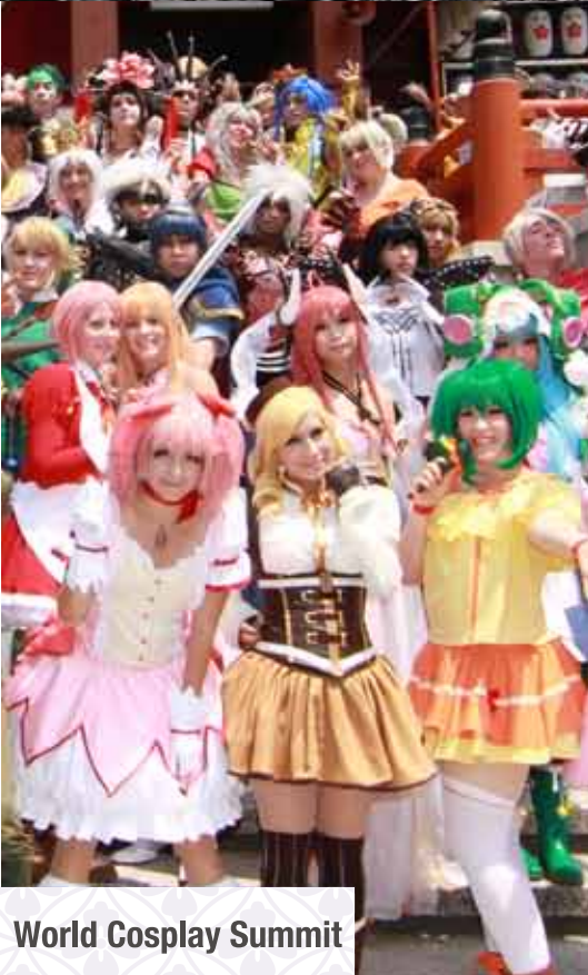
World Cosplay Summit